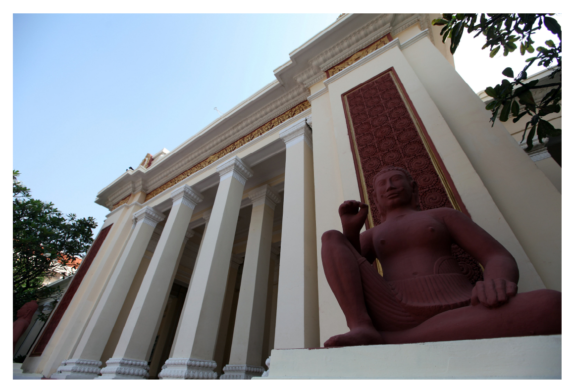
The Court of Appeal in Phnom Penh

The right of appeal is one of the most fundamental of all criminal trial rights<sup>2</sup>; in Cambodia's legal system, the fulfillment of this right requires the accused's presence at the appeal hearing. Unfortunately, this right is routinely violated. The only solution available for most prisoners who wish to attend their appeal hearings is to pay their own way, a practice which amounts to putting a price tag on Cambodians' fundamental rights.