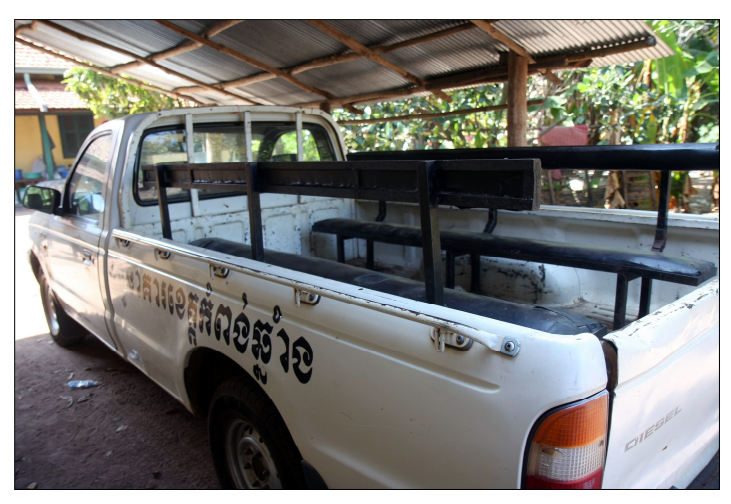
An inmate transportation vehicle at Kampong Chhnang provincial prison.

GDP's long-distance inmate transport network remains a shadow of what is needed to fulfill the requirements of the law. Inmates are occasionally moved to alleviate