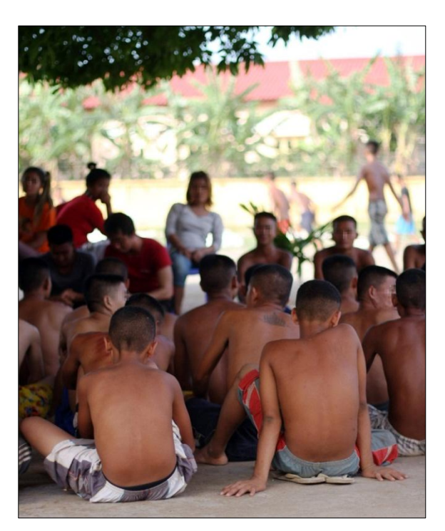
Alleged drug offenders at a drug rehabilitation center in Banteay Meanchey. Detainees are generally not allowed to leave.

This data was more specific than the numbers provided to LICADHO, separating drug crimes into five categories. It also painted an even darker picture: Inmates detained on drug-related charges nearly tripled in one year: