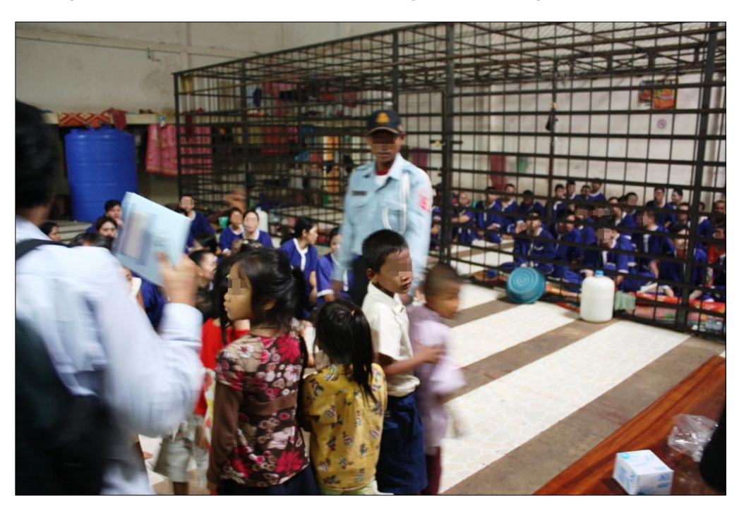
Incarcerated mothers and their children in Pailin prison. Male prisoners spend most of their day inside a cage, which is pictured in the background.

The arrest of drug users, in particular, is a problematic criminal justice strategy. Experts widely agree that drug users don't belong in detention.<sup>20</sup> Imprisoning drug users is an expensive, ineffective and dysfunctional approach to treatment. If the government is serious about drug treatment as an alternative to prison, it should consider community-based treatment programs, where participants are free to go home at night.