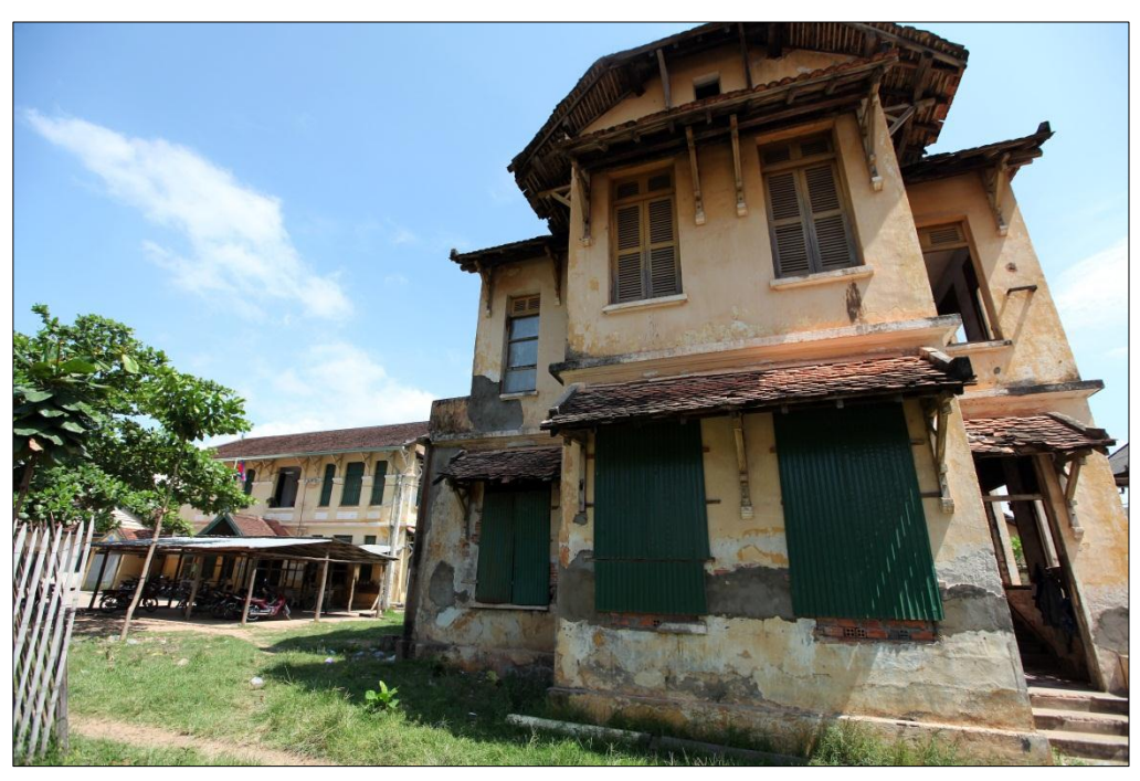
A colonial-era building lies in a decrepit condition inside Kampot prison. The prison was built in 1936, and as of May 2012, it held 454 inmates – over 280% of its rated capacity.

In the final section, we review key recommendations made in our 2010 and 2011 reports, and track the progress made toward fulfilling them.