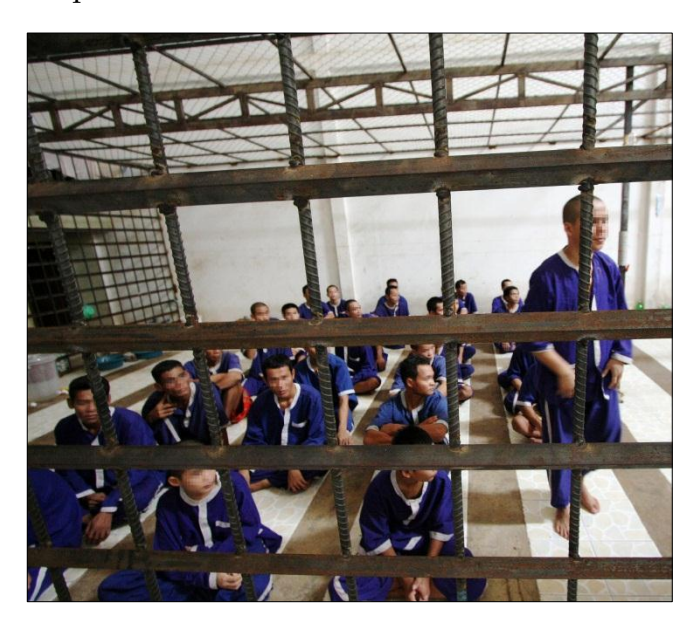
Male prisoners sit inside a cage at Pailin prison. The prison – housed in a former movie theater – opened in 2011 as a temporary facility, but construction on the permanent jail has yet to begin.

Many of these projects are likely years away from completion. Indeed, there is still no estimated completion date for the new Pailin prison, which is extremely urgent given that prisoners currently live an old movie theater. Conditions there are among the worst of all prisons in